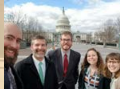
MENTOR Vermont and Vermont mentoring program staff at the 2018 National Mentoring Summit